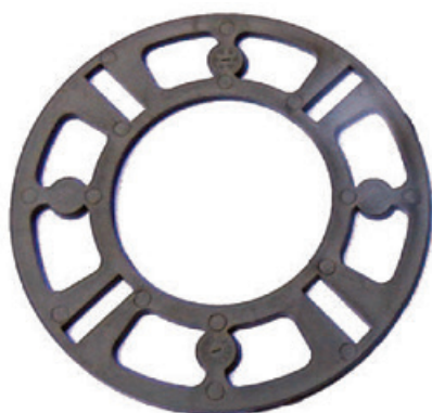
Spacer shim ring - 3mm

The base of the paver support has a smooth profile which minimises the possibility of damage when used on top of bituminous or other membranes. The base can be easily split into quadrants or halves for perimeters and corners.