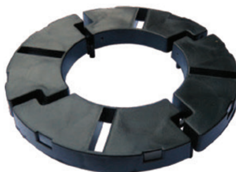
PS2 under side