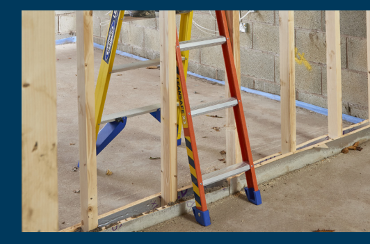
Compact rear section fits between framing studs