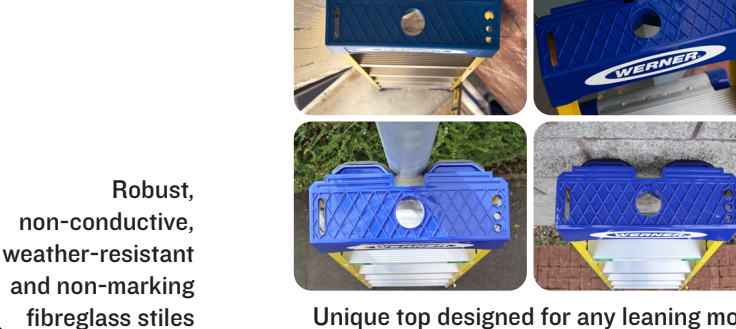
Unique top designed for any leaning mode