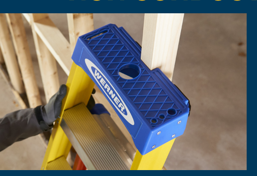
Unique top for corner, stud or pole leaning