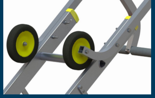
Wheels for easy manoevering on the roof