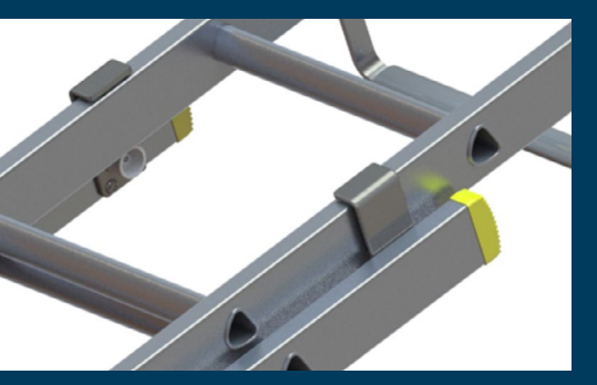
Heavy-duty locking catches for increased safety